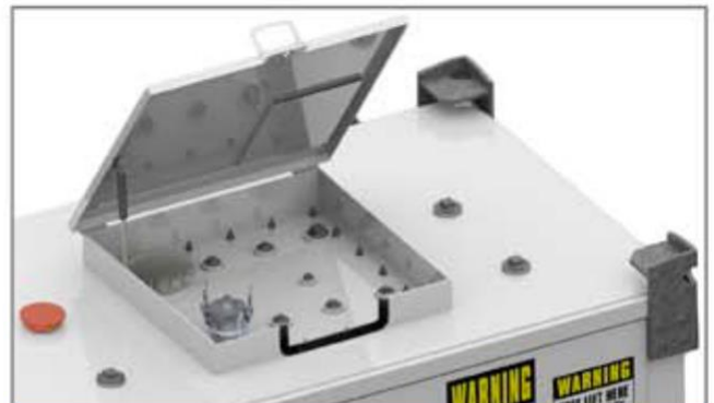
Typical inner tank configuration

Secure During Use - fuel hose access feature enables cabinet to be kept locked while supplying fuel