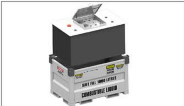
Innovative tank design